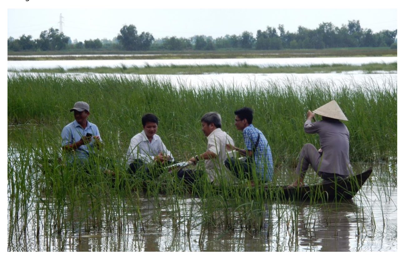
Figure 17 Our project team and visitors navigating a rice field during flood season.

Indicators agreed to in the MEL plan are also documented. The narratives documented for each indicator briefly detail changes that occurred as a result of project activities, and the project's contribution to these changes.