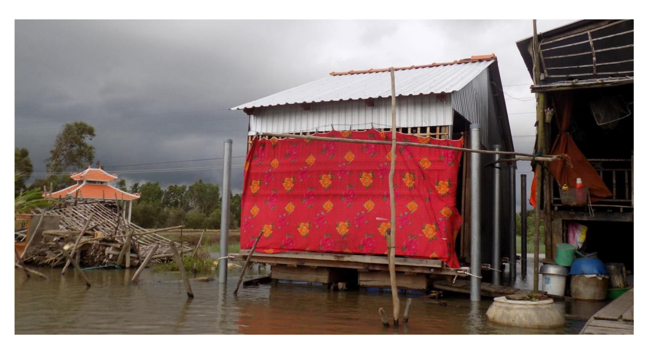
Figure 21 Nguyen Thi Dung's house floating after amphibious retrofit.