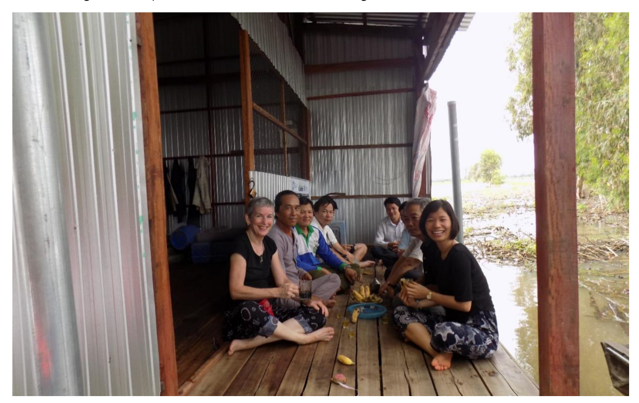
Figure 8 Team site visit conducted in early October 2018 during peak flood period for first-hand experience of amphibious homes while floating.

The following is a description of successful activities, challenges, and lessons learned.