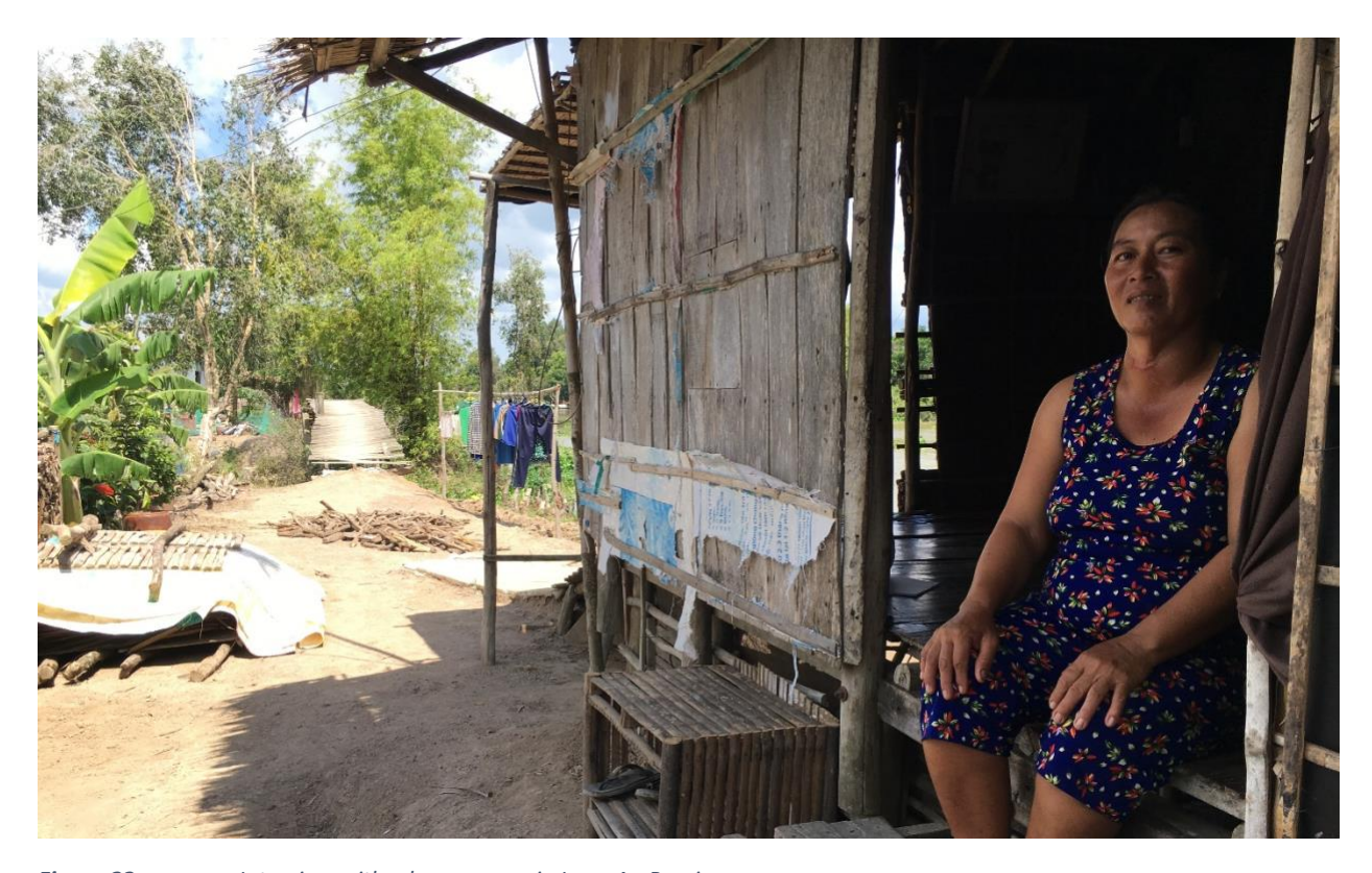
Figure 22 Interview with a homeowner in Long An Province.

The project was initiated on the basis of internal, external and other assumptions to allow us to proceed. These included assumptions related to access to services during flooding, adequate flood levels in the region, coordination with engineering consultants, as well as the availability and cost of suitable construction/retrofit materials. Some of these assumptions proved to be true, and some false, but all of them resulted in critical learning experiences that can be applied to future retrofits to efficiently acquire data and reduce time spent as well as costs.