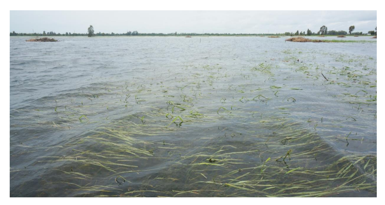
Figure 26 Floating rice field during the flood season in An Giang province.