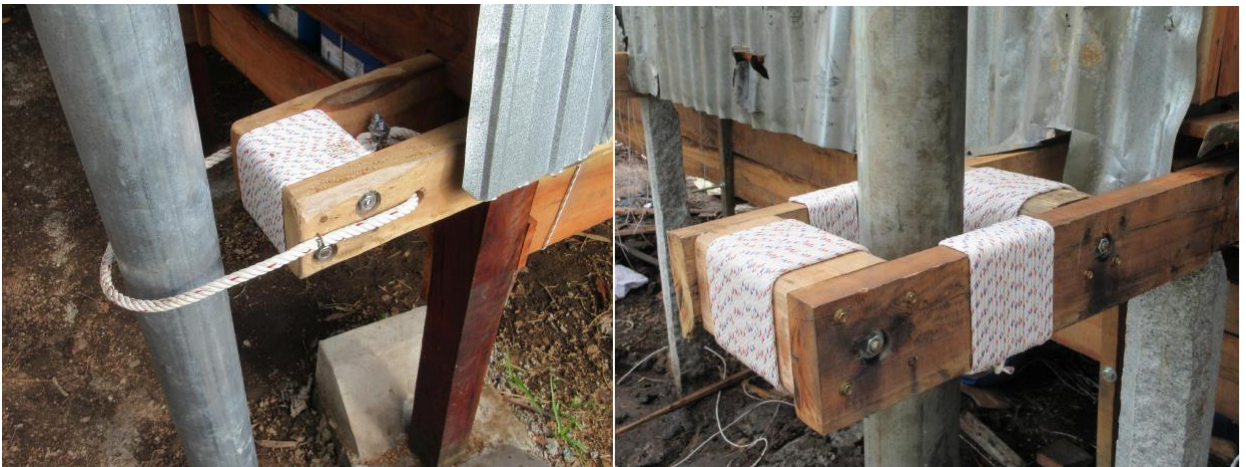
Figure 14 Different methods of construction for sleeves around the vertical guidance posts. On the left is a rope sleeve that loops around a vertical guidance post on Nao's house and on the right is a wood box sleeve with rope cushioning on Lac's house.

Different areas of knowledge and language barriers between the Canadian and Vietnamese teams potentially posed difficulties in robust design and retrofit completion. The Canadian team undertook very careful calculations to reduce the margins of errors associated with the engineering aspects, while the Vietnamese team, specifically the carpenters, contributed their extensive knowledge of local construction practices. These fruitful discussions eventually yielded newly invented design details that were true products of effective collaboration.