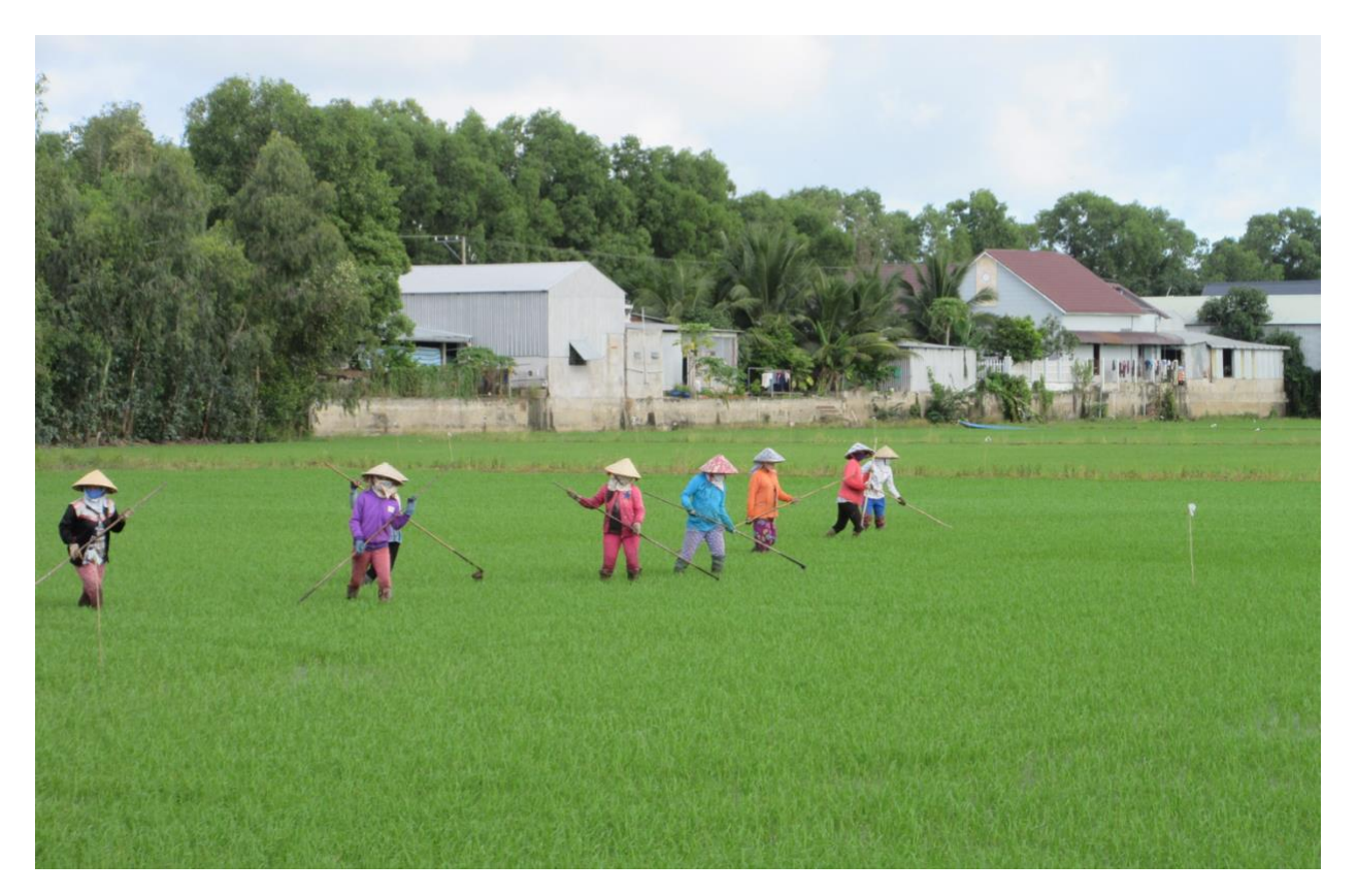
Figure 25 Mekong Delta rice farmers working in a field.

We learned that project homeowners/recipients, and almost every individual who witnessed the amphibious home concept in action, quickly recognized the benefits of the homes for flood resilience: amphibiated homes were protected from inundation, meaning that families did not incur expensive and stressful property damages typically associated with seasonal flooding. This recognition was also shared by the Vietnamese partners, local officials, residents and carpenters who were involved throughout the length of the project. The same learning process would likely also occur during scaling up. As previously stated, this project also has the potential to enhance other dimensions of community resilience in the future, such as economic resilience and sustainable livelihoods, by providing opportunities for entrepreneurship related to amphibious construction.