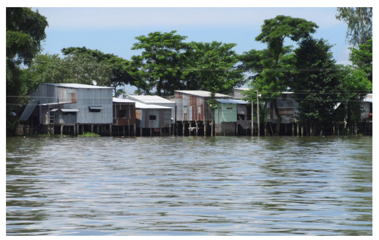
Figure 2 Houses situated along the water in the Mekong Delta.