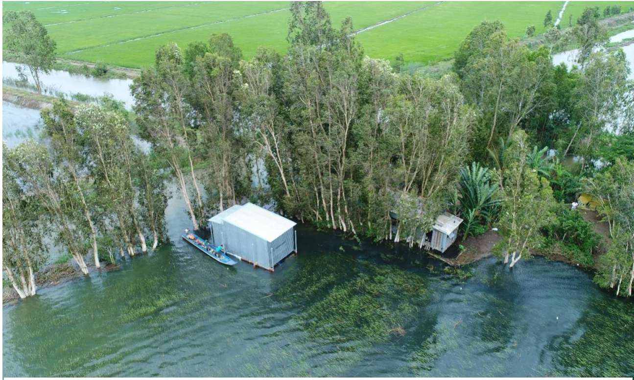
Figure 1 Aerial photo of Nauyen Van Nao's Home during the flood season in An Giang Province