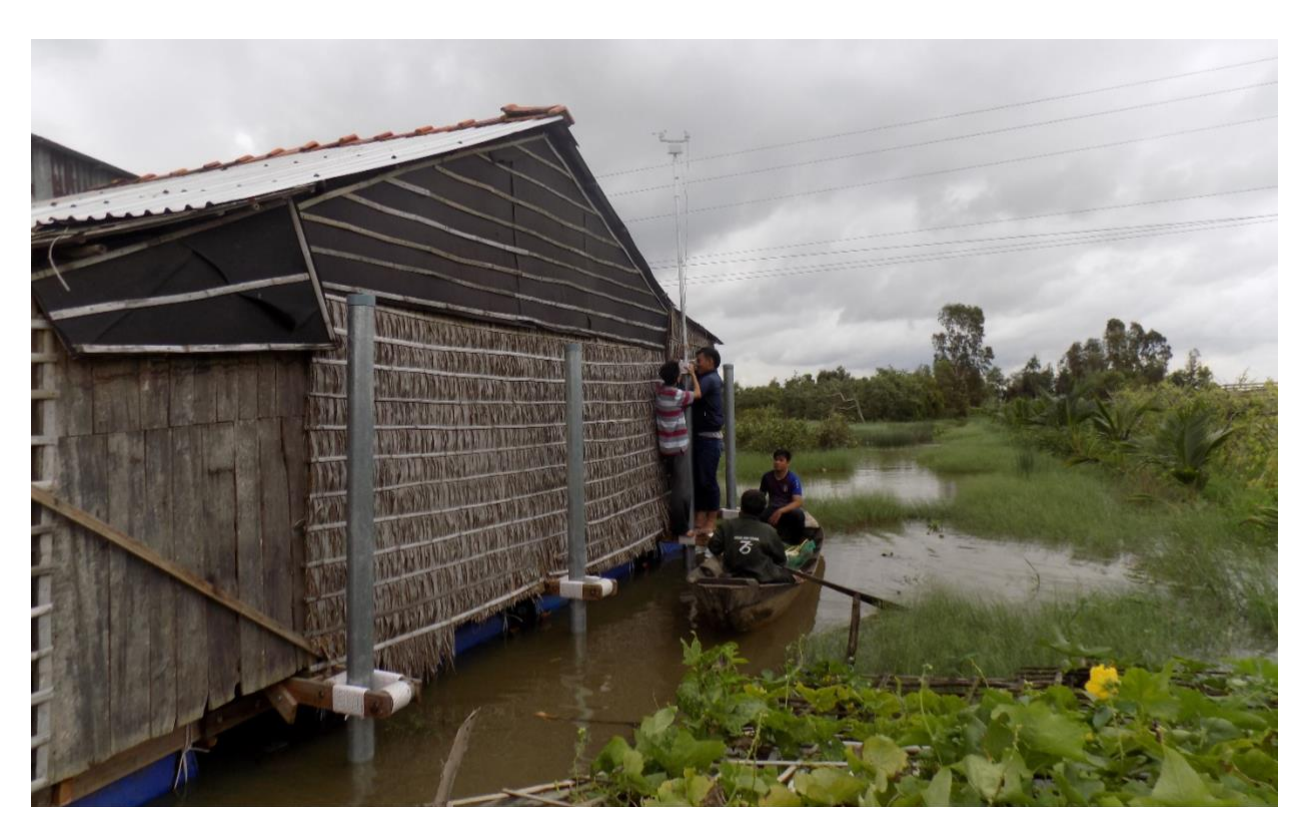
Figure 7 Monitoring equipment being installed on Dang Van Nang's home.