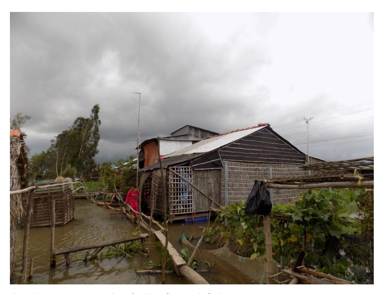
Figure 20 Dang Van Nang's retrofitted home floating in the flood season.